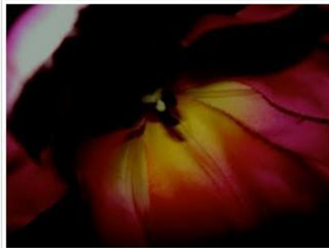
Flower in Bloom

I chose this picture of this flower because it had my favorite colors on it. The flower has pink, yellow and some black in it. The flower