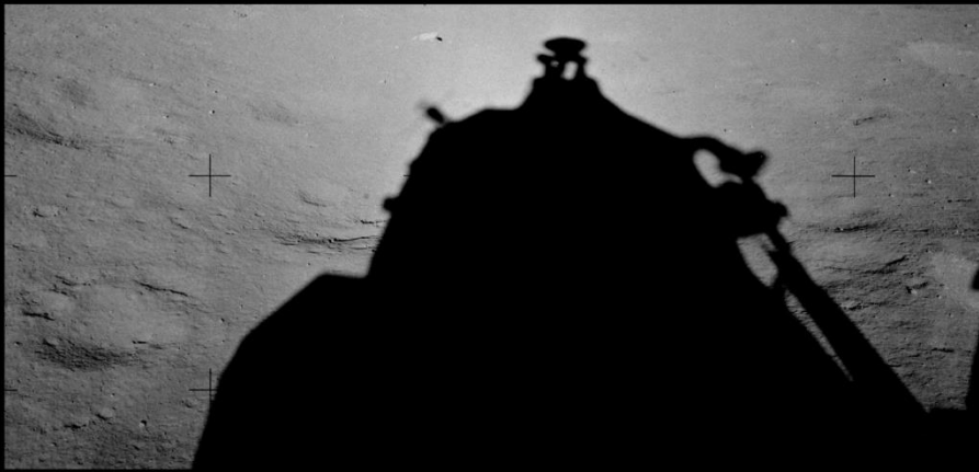
Falcon (Apollo 15)