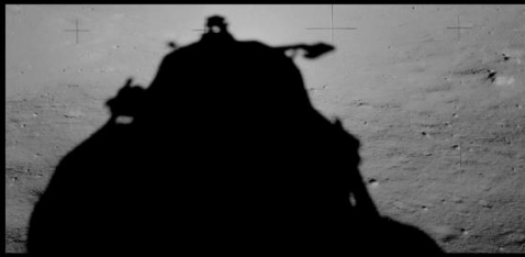
Eagle (Apollo 11)