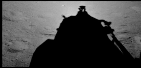
Falcon (Apollo 15)