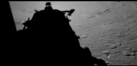
Challenger (Apollo 17)