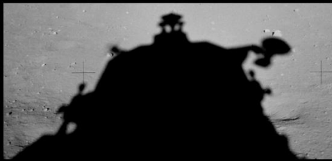
Orion (Apollo 16)