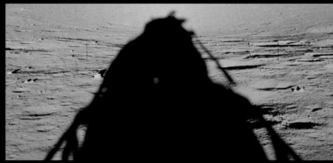
Intrepid (Apollo 12)