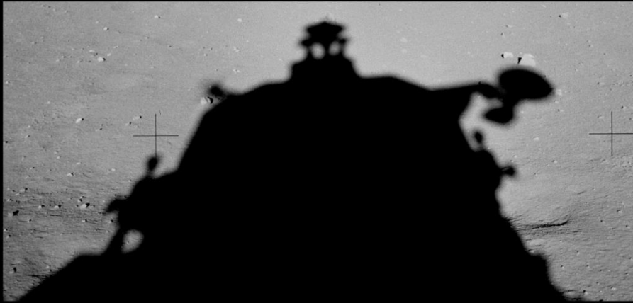
Orion (Apollo 16)