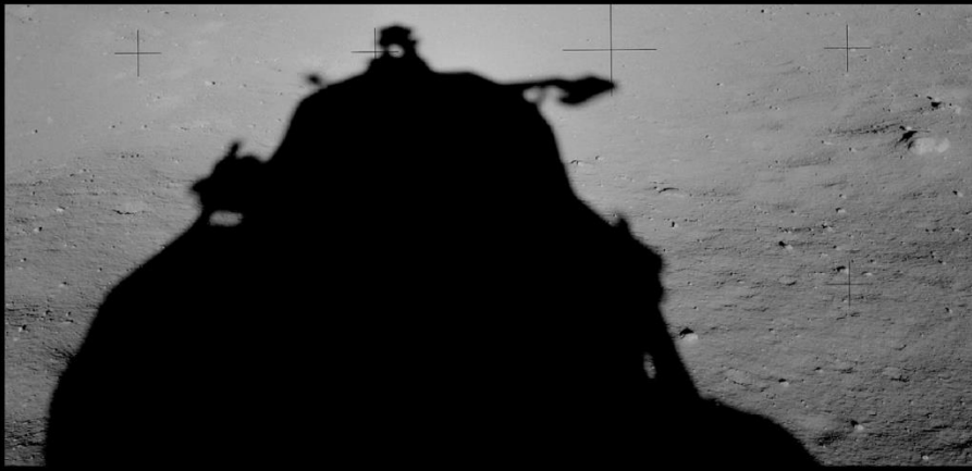
Eagle (Apollo 11)