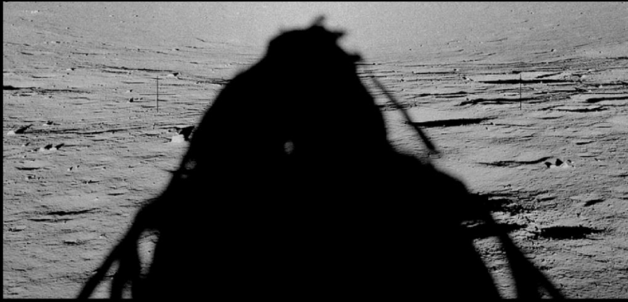
Intrepid (Apollo 12)