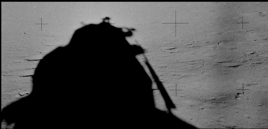
Antares (Apollo 14)