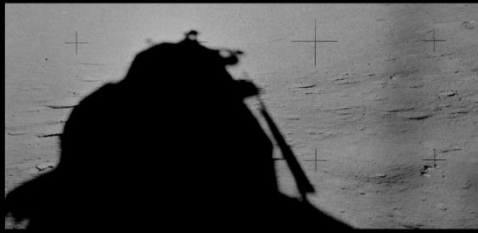
Antares (Apollo 14)