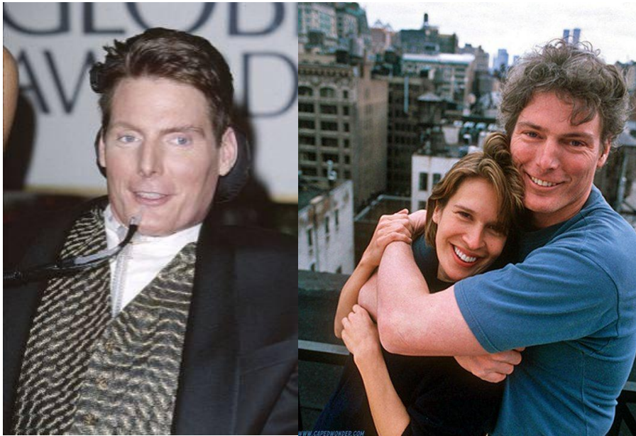
Above, him and his wife.