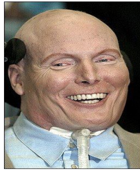
Above, him in his last days before he died.