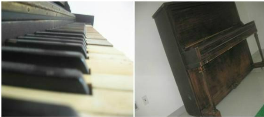
Rosy Martinez, 7 th Grade

Have students look at something from more than one perspective - enhances critical thinking - "Composite" - see photo: